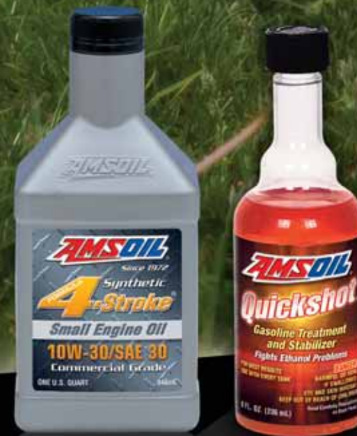
SYNTHETIC MOTOR OILS