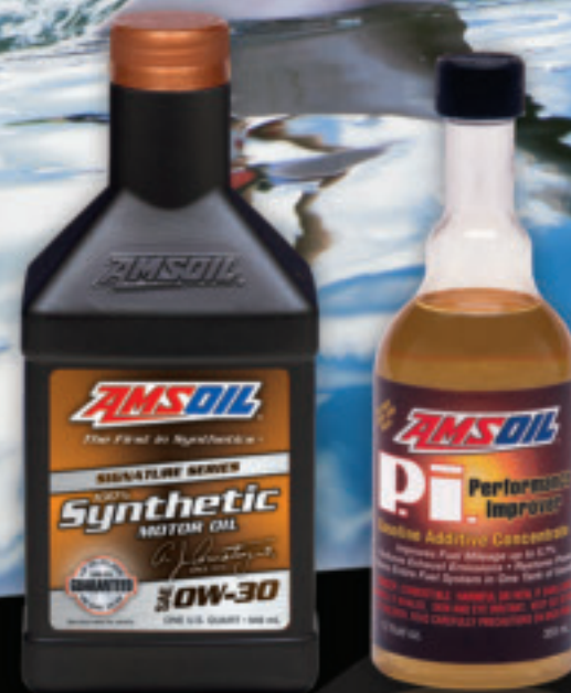
SYNTHETIC MOTOR OILS