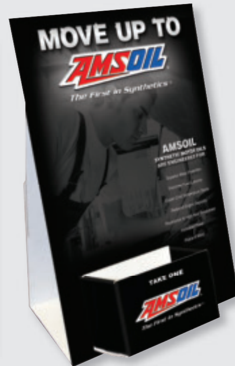
P-O-P Literature Display (G3405)