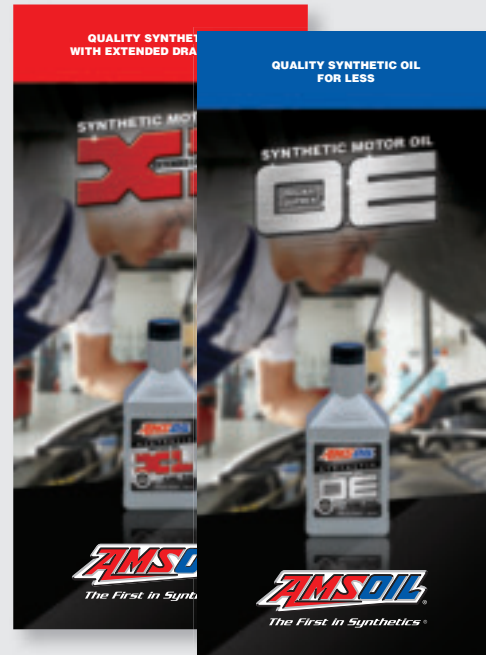
XL & OE Brochures (G3406 & G3407)