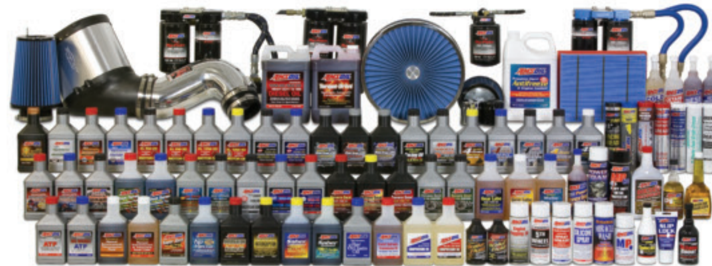
AMSOIL manufactures a full line of synthetic lubricants and performance products for people who appreciate quality.

Many lube operators are beginning to see the trend toward extended drain intervals as an opportunity, servicing customers who want the convenience without sacrificing protection. Properly priced, offering premium extended-drain oil frees up time and service bays, allowing shops to service more regular customers. AMSOIL XL Synthetic Motor Oils have a service life of up to 10,000 miles or six months, whichever comes first (or longer when relying on factory-installed oil life monitoring systems).