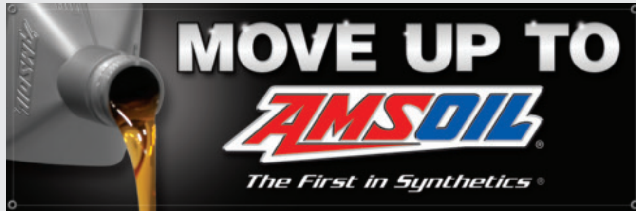
2' x 6' Banner (G3421)

Existing accounts that have already received a banner kit will receive the new kit when purchasing a qualifying order of OE oils.