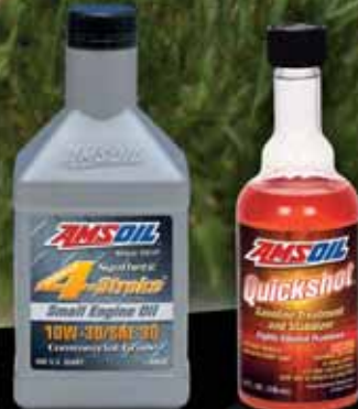
SYNTHETIC MOTOR OILS